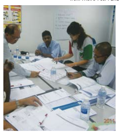
Group A doing their asignments