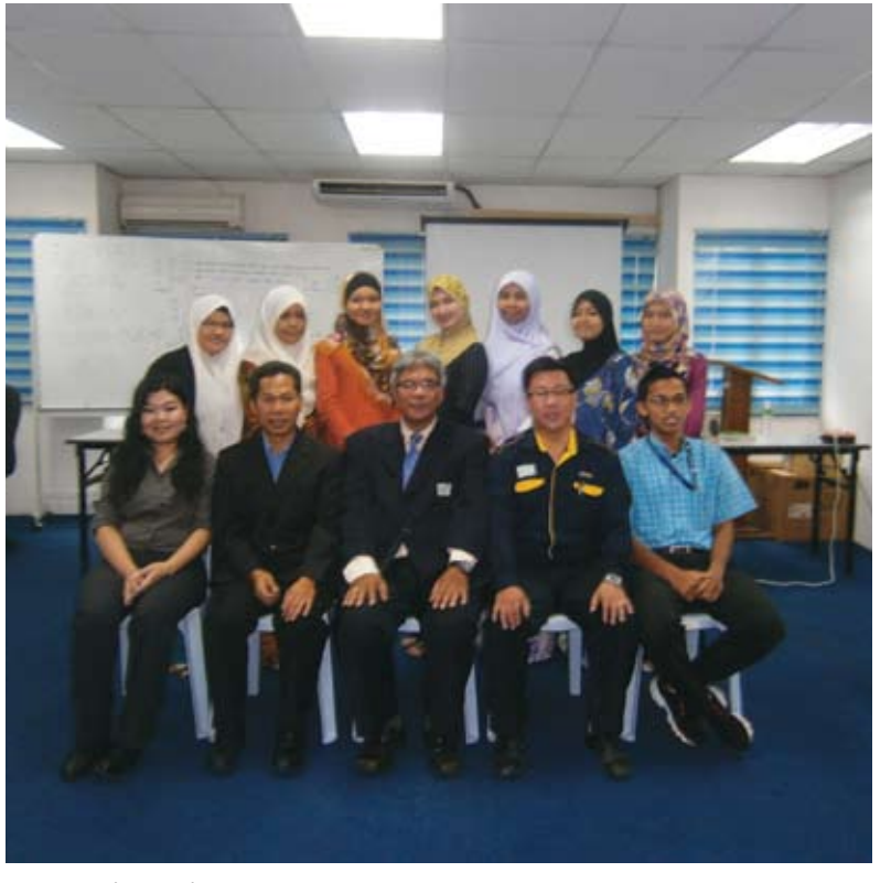
Group photo with PCAM exco