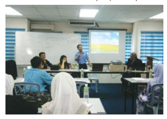
Question and answer session