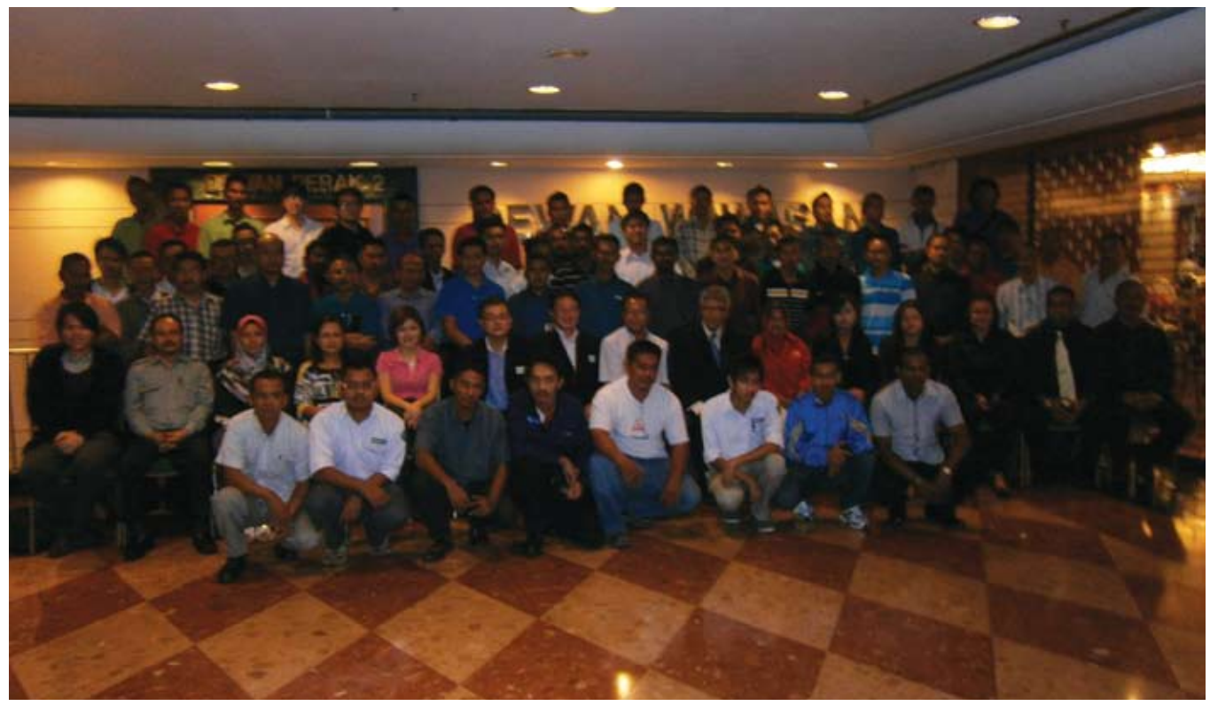
Group photo with 80 participants