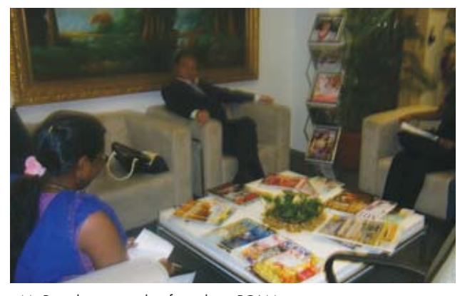
\ensuremath{\mathsf{Mr}} President giving briefing about PCAM