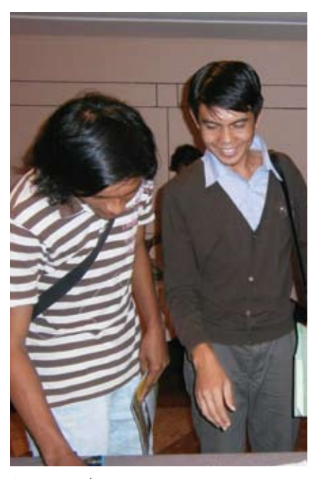
Registration by participants