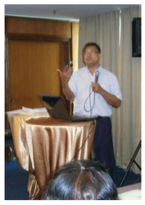
En Sai pol from Agrofog presented on Pesticide usage